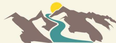
DRINA-TARA CROSS-BORDER STACKHOLDER GROUP