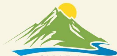
SHARA CROSS-BORDER STACKHOLDER GROUP